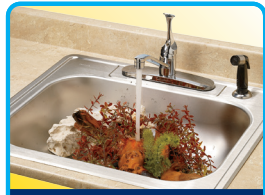
Rinse plants and décor items