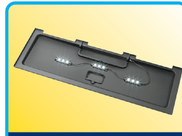
Remove insert from back of light hood