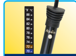
Add thermometer, heater to aquarium