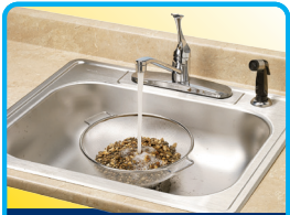
Rinse gravel in colander