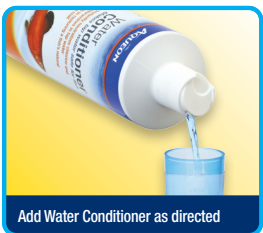
Add Water Conditioner as directed