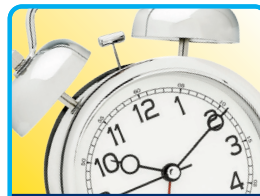
Wait 24 hours before adding fish