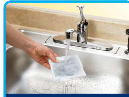
Rinse filter cartridge before use